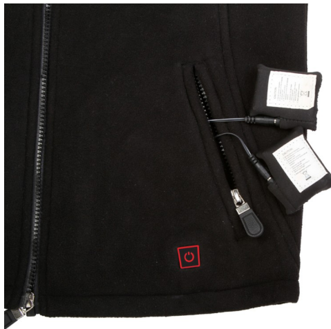
ON/OFF button with temperature control THERMO VEST

Turn OFF the belt by pressing the ON/OFF keypad control button several seconds until the LED-light turns off. Always unplug the battery when the belt is not in use and store them in the battery pocket of the belt.