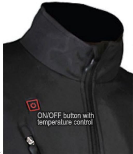
ON/OFF button with temperature control THERMO JACKET

The Li-Ion batteries reach its full power after having been fully charged and fully drained several times! Additional batteries can be purchased separately if extended heating times are needed!